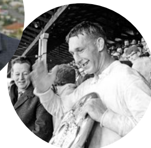
Ex-All Black and founding member of NZRF, Kel Tremain.

working in partnership with players for the duration of their lives.