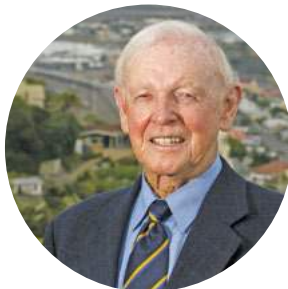
Founding member of NZRF, Sir Russell Pettigrew.

Become a member of The Pettigrew Giving Circle and you'll be rewarded by connecting with a group of supporters dedicated to making a real difference to safety in rugby for all New Zealand players.