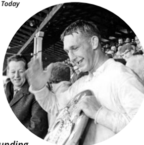
Ex-All Black and founding member of NZRF, Kel Tremain.