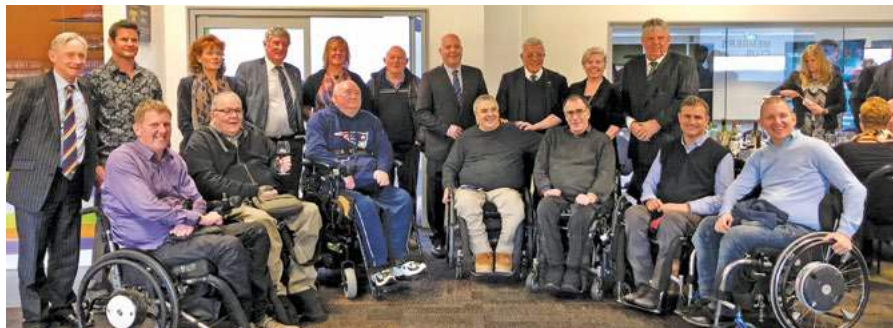
Injured players, care-givers and Rugby Foundation staff and board at the annual Centurions pre-test fundraising luncheon in Wellington.